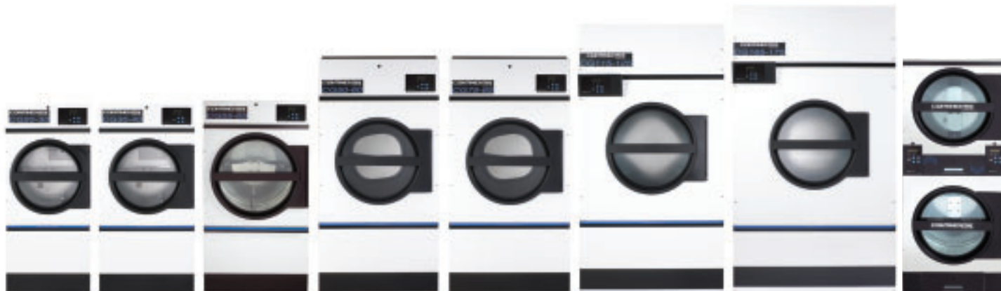
Pro-Series II Drying Tumblers

INTEGRATED FIRE CONTROL Most single-pocket dryers offer an optional Integrated Sprinkler System (ISS), a sensing and extinguishing device that squelches dryer fires before they get out of control. ISS, which is available on Continental Pro-Series gas and steam units, ensures laundries are better protected from the hazards and damage caused by dryer fires. ISS is always active – even after a load is complete – offering added protection when a laundry is unattended. If ISS sensors detect a fire inside the dryer drum, the drum rotates and distributes water vapor—saturating laundry and extinguishing the fire. ISS continues to monitor the condition of the dryer and restarts if fire is again detected.