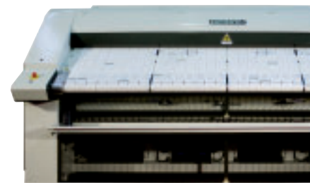
5-in-One Ironing System