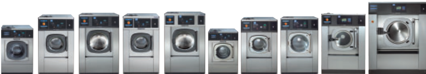
M-Series Hard-Mount Washer-Extractors

WASHER TO IRONER Damp flat goods can be fed straight from the washer through our ironers for a perfect finish—eliminating the time- and labor-consuming step of dryer conditioning thereby reducing linen wear and improving productivity.